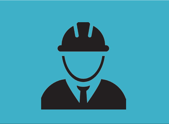
Section Two: Getting ready for the real world

Students with real experience can expect to get the best jobs, with the best salaries, and the best prospects. The irony is that this expectation can be delivered within an HE institution's estate, in real-time, with real problems, real solutions and, what's more, real data; effectively bringing the job placement into the place of learning.