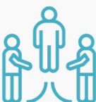
Chart a course through the many areas of detail that often slip companies up pre-construction planning and project initiation